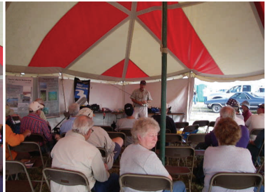
Showing the group Kistler Rods