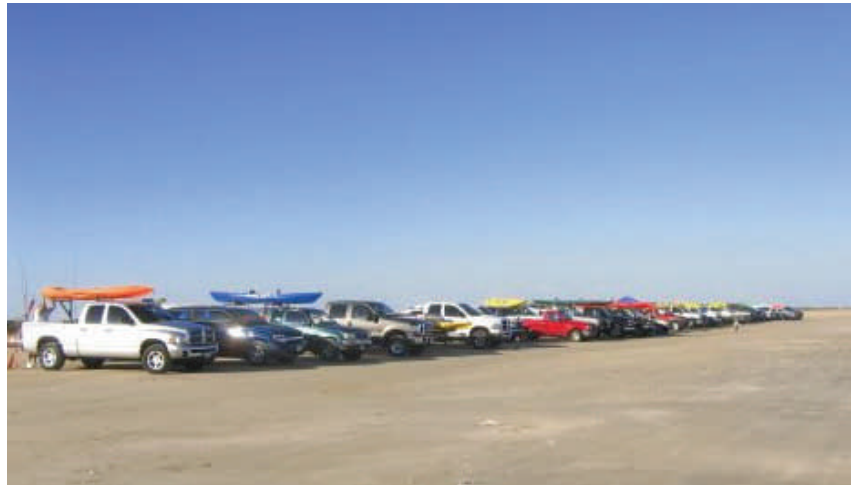
Cars lined up on the Beach