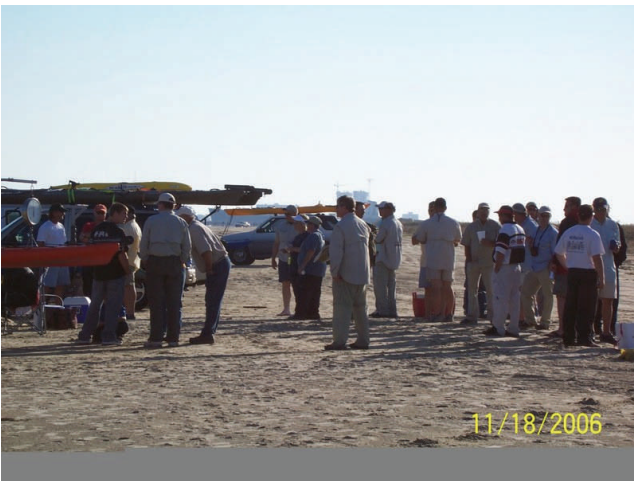
Gathering on the Beach for the weigh in