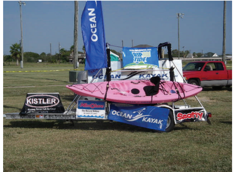
Promotion Trailer at Everything Kayak Expo

Team Ocean Kayak always jumps at the opportunity to present seminars on kayak fishing and kayak rigging. We are able to discuss and demonstrate the equipment that we use and the products that we represent with people interested in the sport. The visibility we gain from performing seminars like this, adds to the credibility Team Ocean Kayak is building within the water sport community. Team Ocean Kayak is quickly becoming the face and voice of kayak fishing.