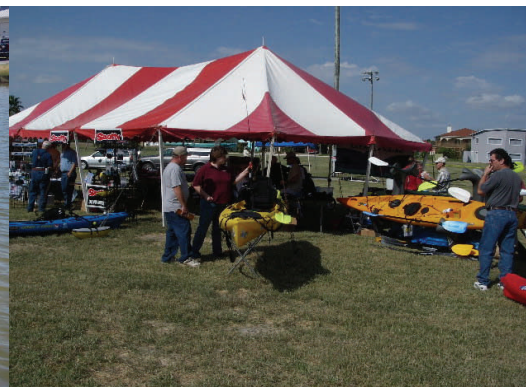
Scotty rigged kayaks on Display