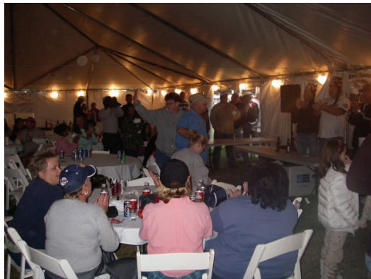
Even Larger Crowd at the awards