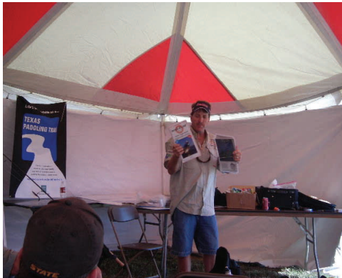
Talking about HookNLine Maps