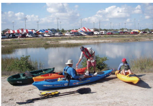
Capt. Filip Spencer with dry land instruction