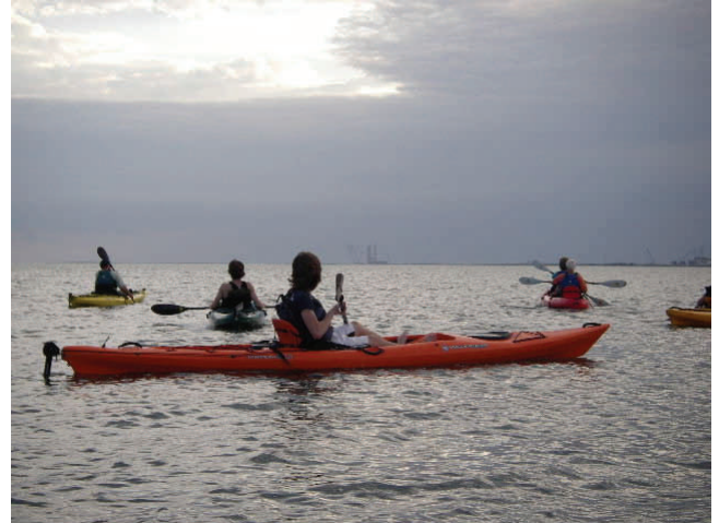
Overcast skies, but the rain held off