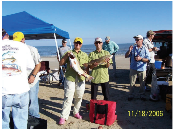
The ladies with their winning redfish