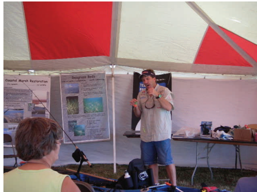
Talking about Pentax Cameras