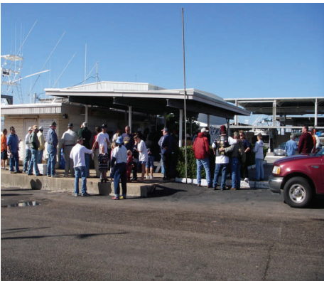
Crowd Gathers for the weigh in