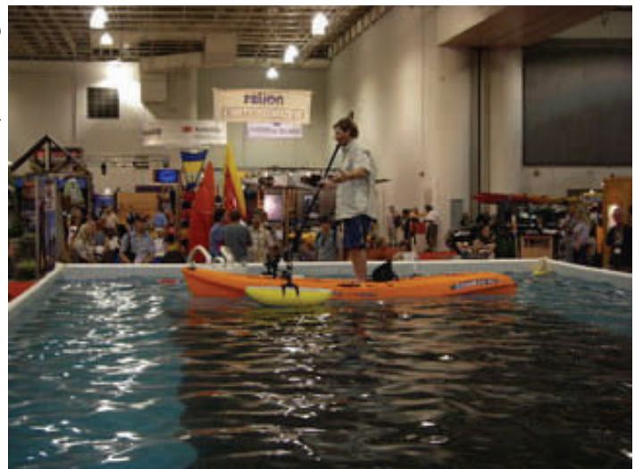
Demonstrating Scotty's kayak stabilizers

October 28, 2006 Fly Casting lessons and get together