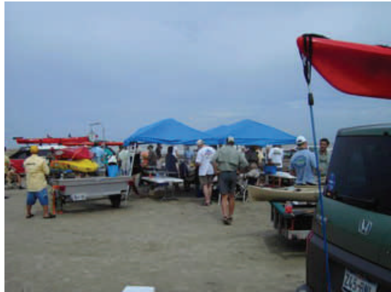
Weigh in at Stars and Stripes Tournament

Anglers spread out into West Galveston Bay under rainy and windy conditions then returned later to the beach for the weigh in and get together. Only one of the teams finished the day with a complete slam stringer, further proof of the difficult fishing conditions.