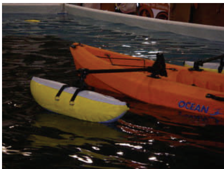
Scotty's kayak stabilizers

During the demonstration Team Ocean Kayak was able to talk about our own personal experiences with the all the great products that Scotty offers and the ways in which we use them in tournament fishing. Scotty has always been a tremendous supporter of Team Ocean Kayak and we were honored to be able to help them out at this year's show.