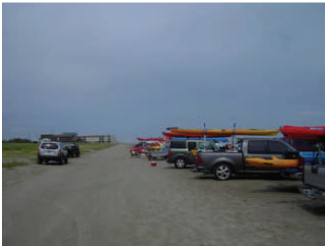
Over 95 kayak anglers competed in this years West Bay