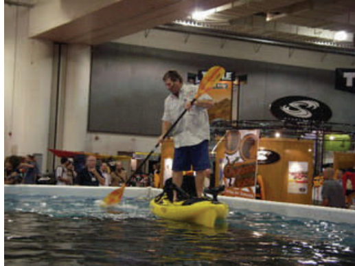
Demonstrating the Big Game