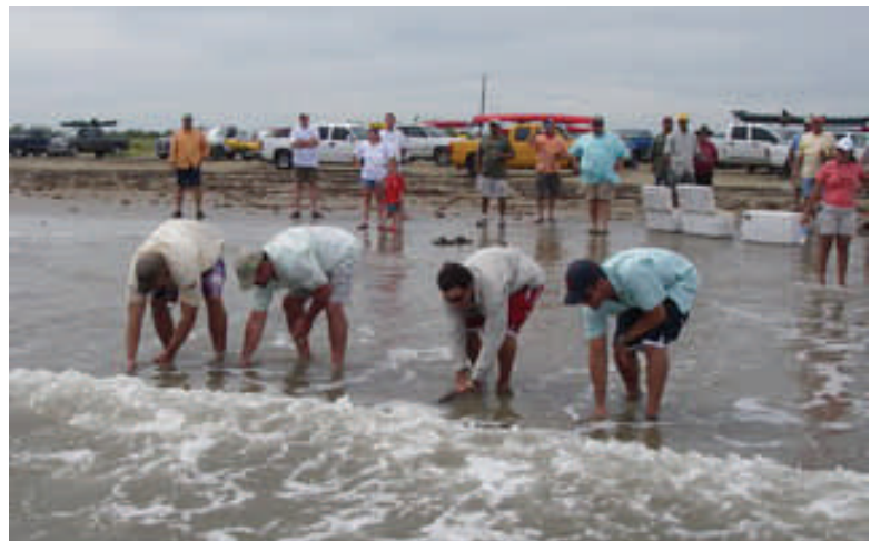
Crowd gathers for the live release