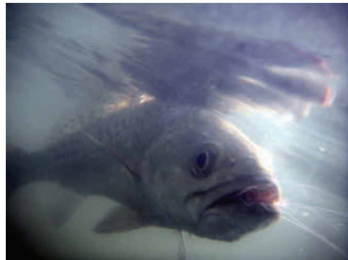
Underwater trout picture using Pentax Optio Wpi