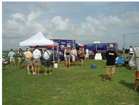
Setting up for the weigh in