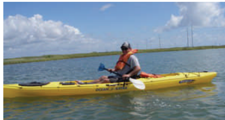
2008 Ocean Kayak Trident was a hit with bigger kids