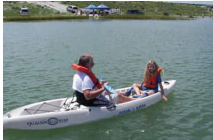
2008 Ocean Kayak Peekaboo was a big hit with the kids