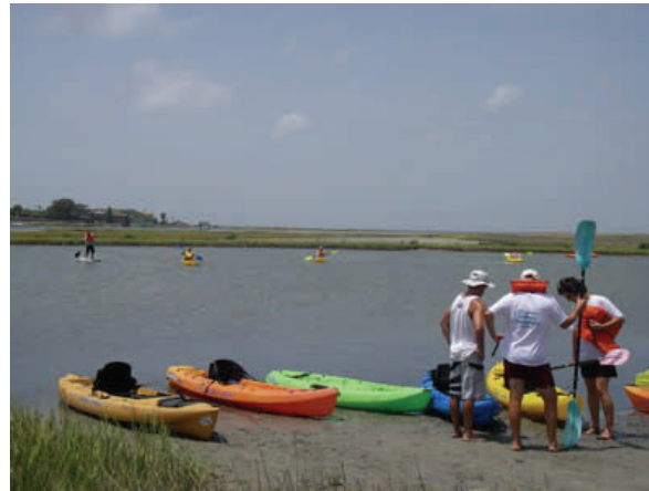
Trying out different Kayaks