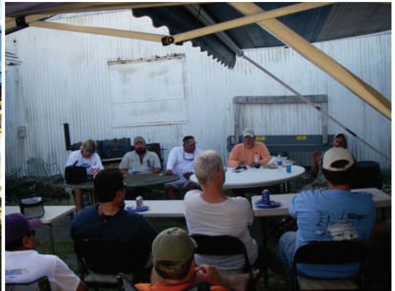
The Captain's Panel