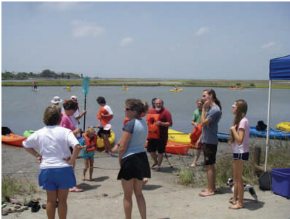
Students enjoying the day kayaking