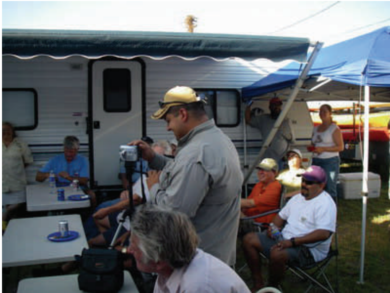
Kayak Anglers asking questions