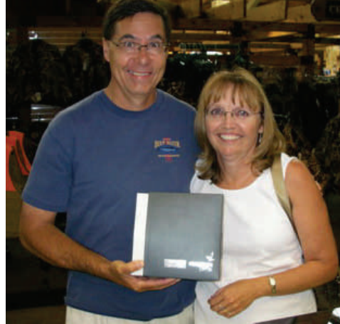
Happy Swarovski Optik customers

Customers were gearing up for the upcoming hunting season and the store was very busy. In the Texas Hill country near Austin, deer hunting rules. Some of the best white tail deer hunting in the country is less than a 30 minute drive from downtown Austin.