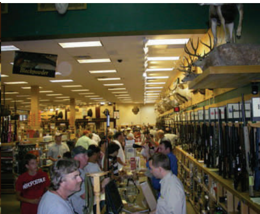
The Gun counter