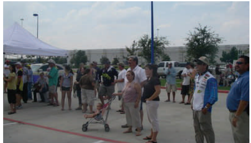
Large weigh in crowds at Academy are the norm