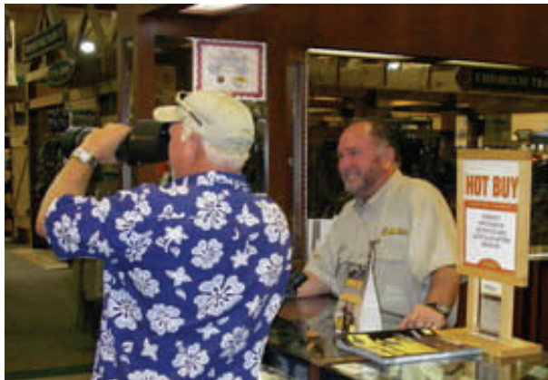
Checking out the Swarovski