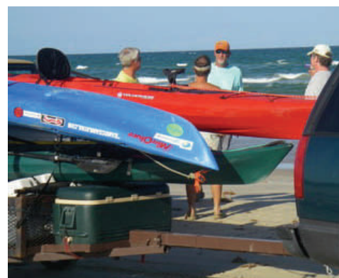
Forming Plan B