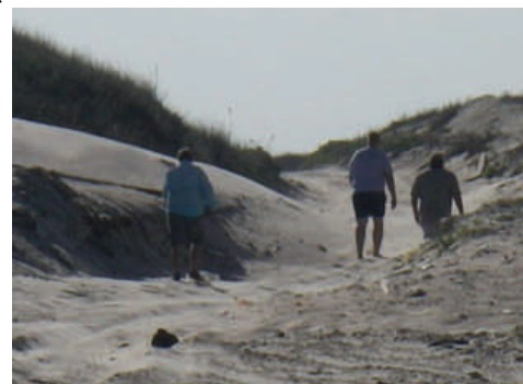
The Pass looks kind of rough