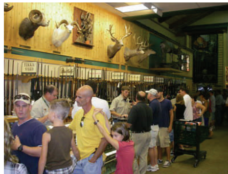
The gun counter was packed