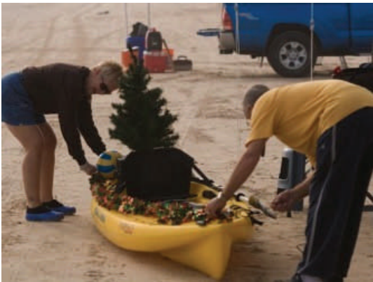
Ocean Kayak doubles as Santa's Sled