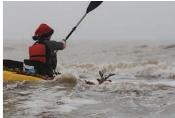
Rudolph taking some waves