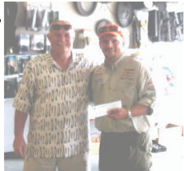
Robert Harvey Big Bass Award