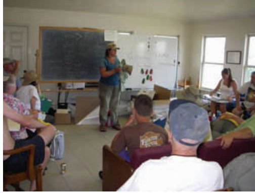
Kayak Safety Clinic