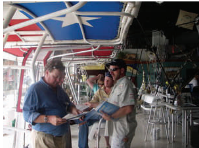
Team Ocean Kayak passing out Sponsor's Literature