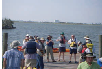
Kayak Paddle Clinic