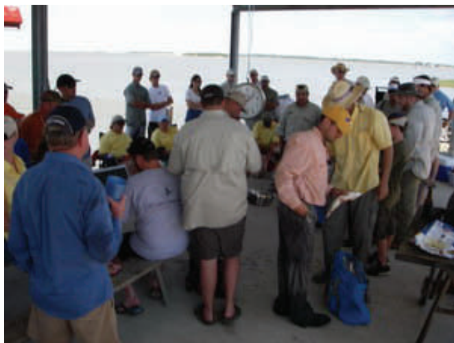
Anglers weigh in their catch at Stars and Stripes