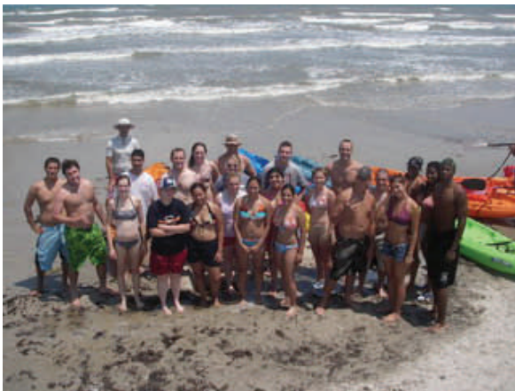
Texas A&M Outdoor Adventure Class