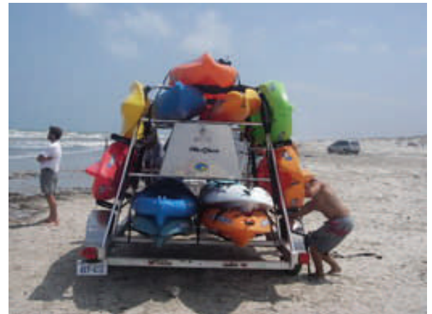
Team Ocean Kayak's Trailer full of kayaks