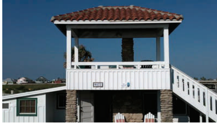
The Hut in St. Augustine Florida our home base