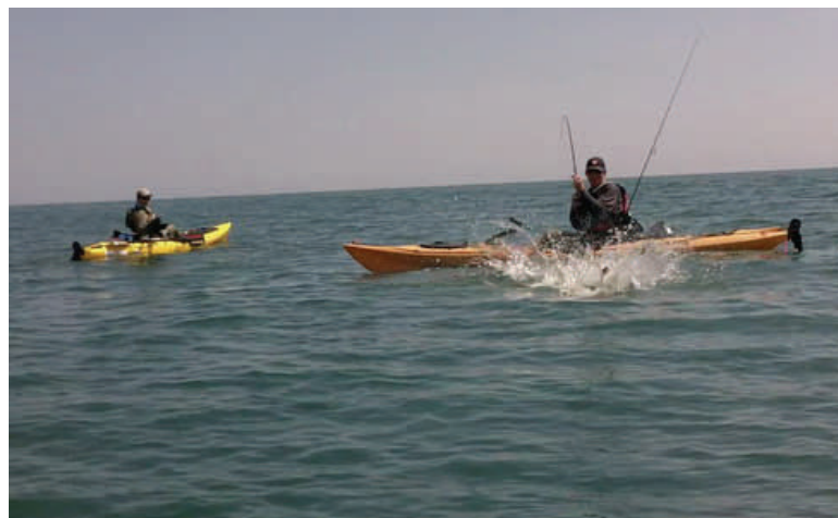
Fishing in the Atlantic Ocean