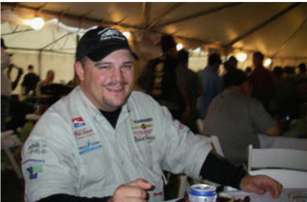
Having fun at the banquet