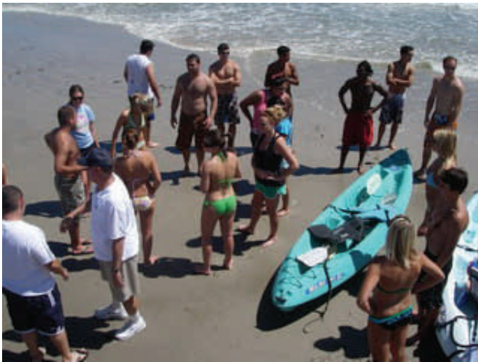
Getting ready for the launch