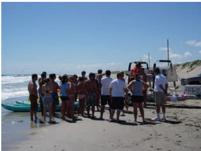
Learning about kayaking from the pros