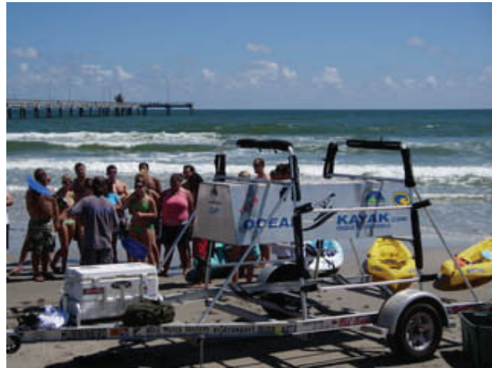
Students gather around the trailer for instructions

Lots of students showed up the outdoor adventure class. Students were able to learn paddling, kayaking safety, how to handle a kayak and rough water and waves and even how to paddle kayaks through the surf. All the students had a great time and wish that the class would last more than three hours. - Capt. Filip Spencer