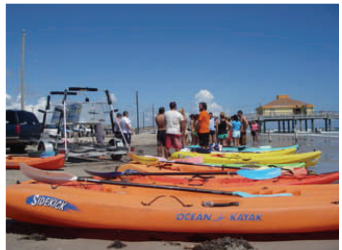
Beautiful day on the water