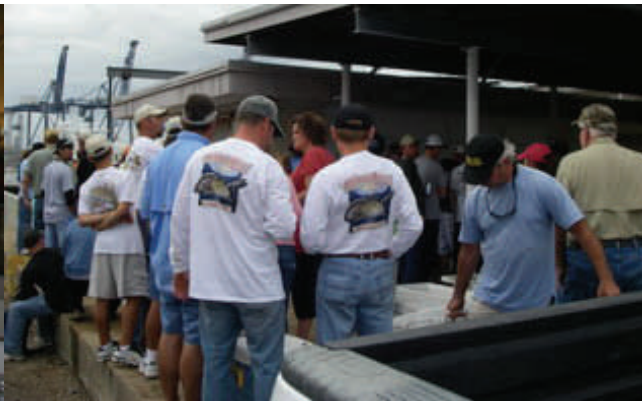
Large lines at the weigh in