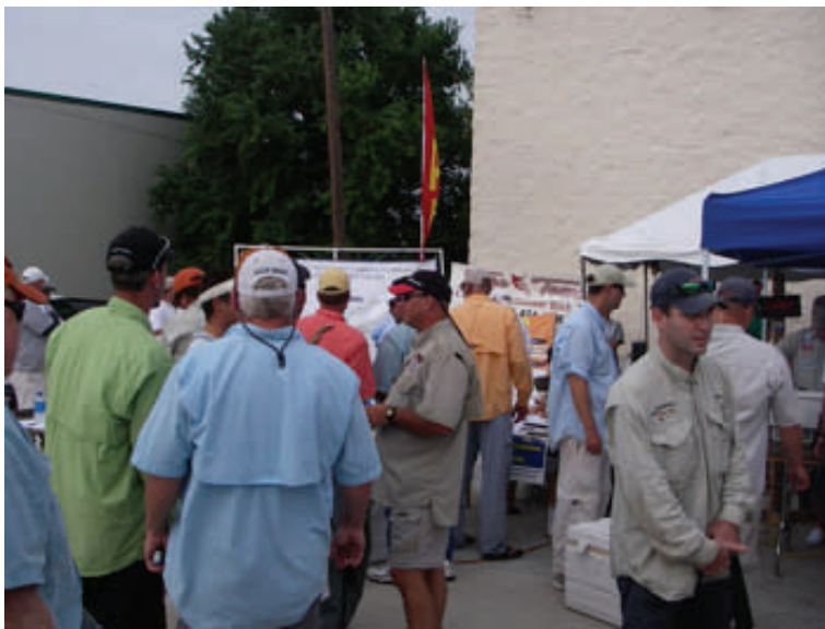
Weigh in Time