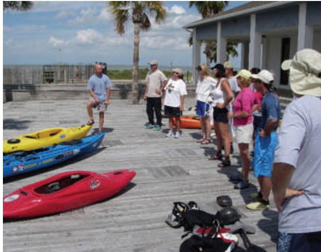
Learning about kayak rocker