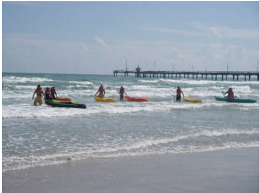
Playing in the Surf

Next year Team Ocean Kayak hopes to incorporate their newly acquired ACA instructor certification to incorporate a paddle safety class with the events planned for next year.