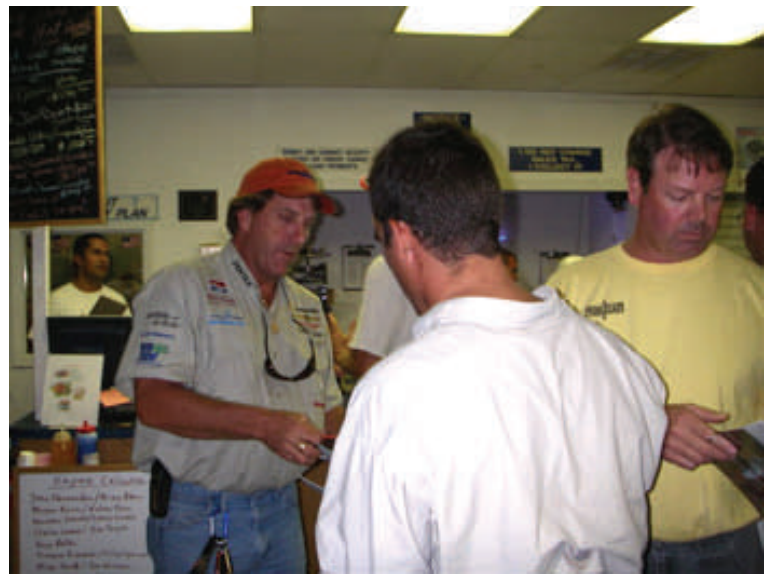
Passing out Sponsors product literature