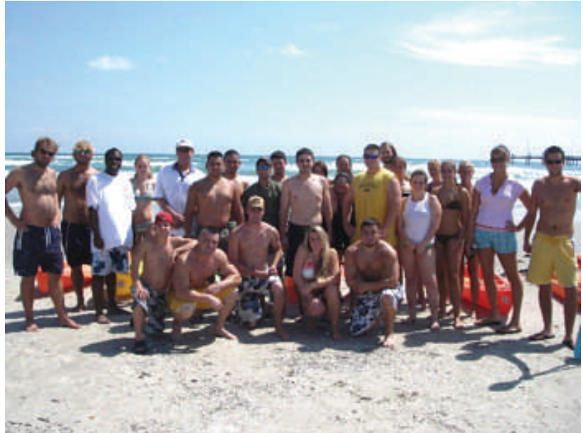
Texas A&M Adventure Club

Team Ocean Kayak travels to these events using our tournament trailer with sponsor logos loaded with a wide variety of Ocean Kayaks.