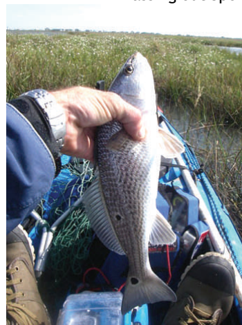
A few inches bigger and we win