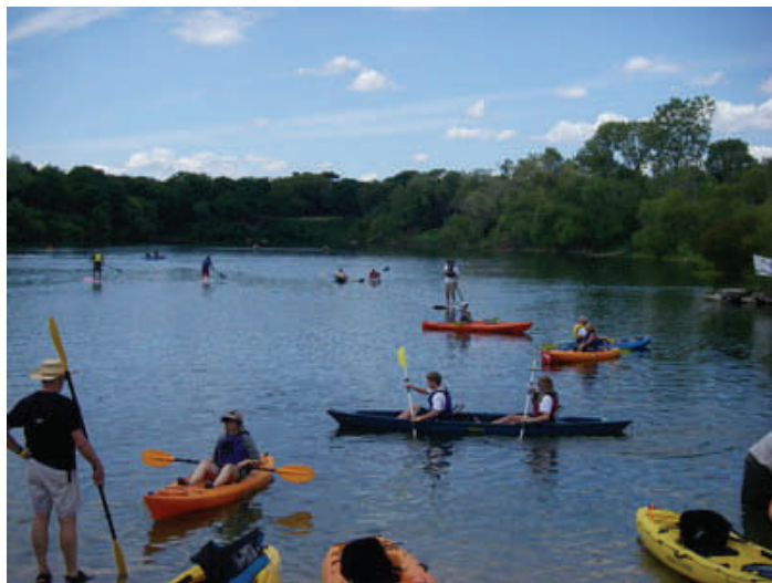
Kayaker's enjoying a beautiful day