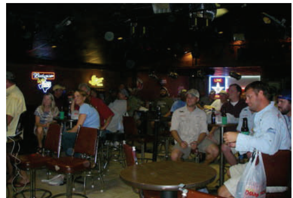
Gathering at the Captain's meeting