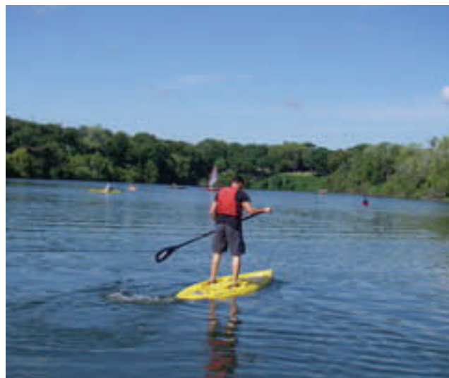
Stand up kayaks were really popular