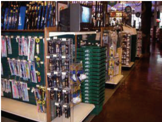
Nemire Lures on display