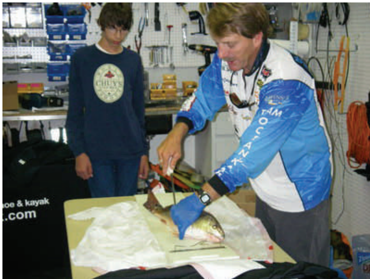
Demonstrating how to filet a fish