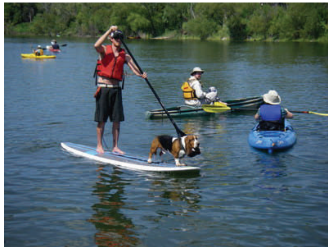
Man's best friend

Austin Canoe and Kayak have two more demo scheduled for this year. On October 3-4, 2009, Team Ocean Kayak will be at Rio Vista Park in San Marcos and at Independence Park in Missouri City.