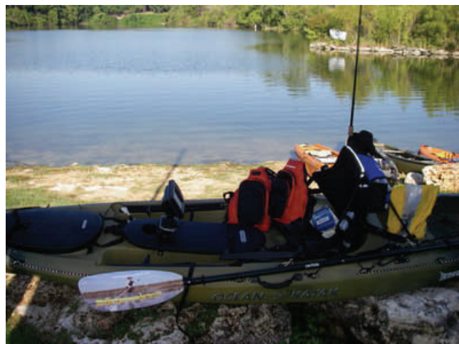
Tournament Kayak on display